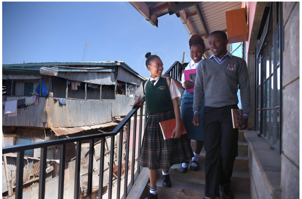
Secondary students anxious to return.

Students in Kenya are now between terms but will be returning to class on May 10. The latest government "lockdown" has kept children from contact with their teachers and schools during a seven week period. This is a dangerous length of time to be roving around the slums of Nairobi, so we are anxiously awaiting the resumption of classes.