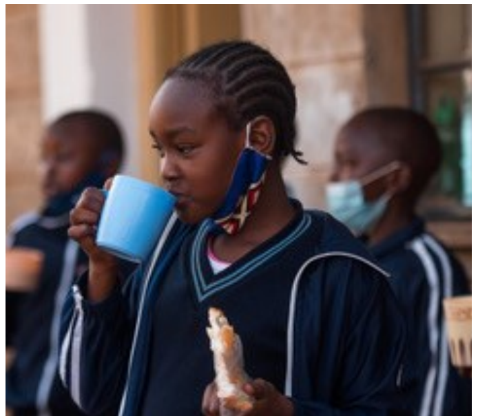
Enjoying porridge and bread.

Current Kenyan protocols require masks and social distancing. To meet these requirements and solve the problem of tight spaces in several of our schools, we are helping some of them rent adjacent space on a temporary basis. Since students must often sit three and four to a desk, we are also helping with the purchase of more desks to allow for the required social distancing, an unexpected but unavoidable expense.