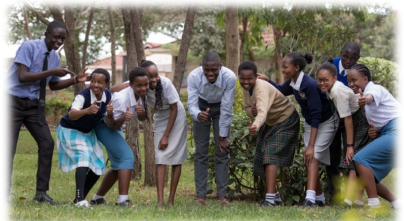
Some of the 30 KCEF-sponsored students at the August “Bridge to Success” workshop in Nairobi

This month, the first three of our partnership students have completed secondary school and are now preparing for university studies in mid-2020. They will attend a “Bridge to College” workshop in February, and then do a three-month community service project beginning in March.