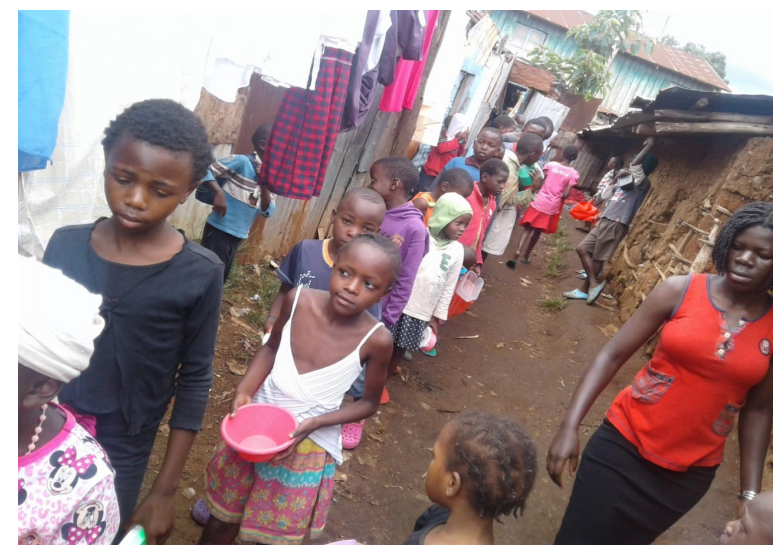
Early on, when cooked meals were provided to 120 students at Blessed Children's Center

When we first learned that all schools had been closed, we contacted each of them about the greatest needs, and their plans. They were all very concerned about the health impact of not providing two daily cooked meals for the children—most of whom rely on them as a primary source of nutrition and strength. All teachers realize how much better the students learn and respond in class when they have been fed.