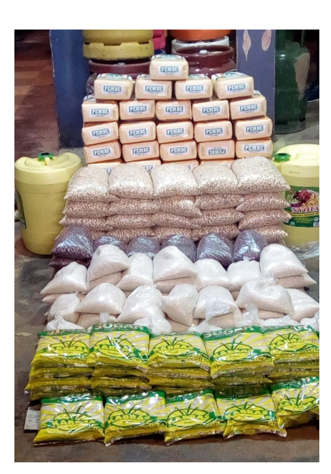
Food packs ready to go at Kicoshep School in KIBERA

Our schools then changed their approach to providing a "food pack" of dry food that would last a family for one week—and then having them return a week later. These included maize flour, beans, rice, cooking oil, etc. One school has a large garden and is able to add a few vegetables for each family.