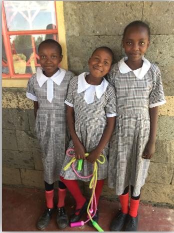
Gentle Bells Students

During our visit in January 2019 we were amazed to see the changes: